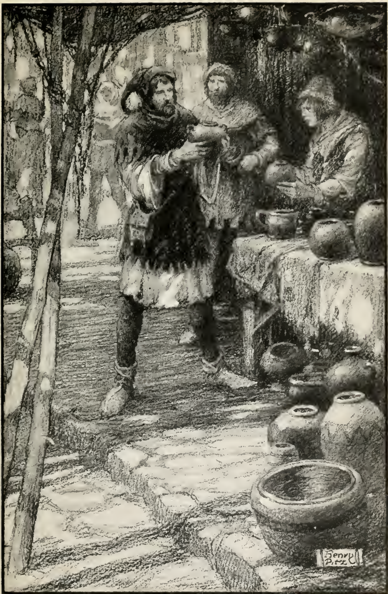
AND SO WE WENT GADDING ALONG, DROPPING IN HERE AND THERE, PRICING THINGS, AND GOSSIPING WITH THE SHOPKEEPERS ABOUT THE RIOT,